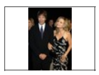
David E. Kelley